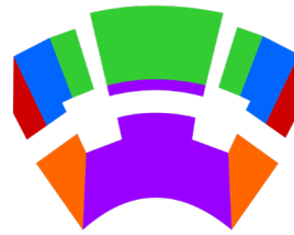
Classics in Concert