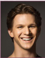
DANIEL ULBRICHT PRINCIPAL WITH NEW YORK CITY BALLET